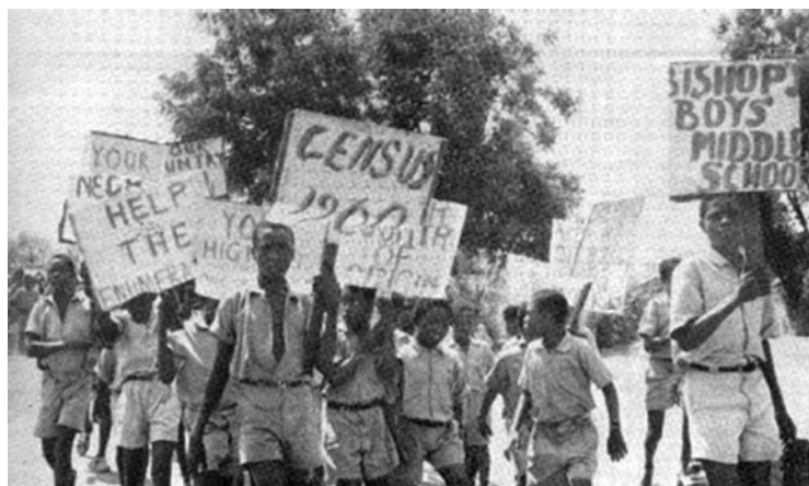
FIGURE 1. School children show their support for the census. Gil and de Graft-Johnson, Census , vol. V, n.p. Reproduced with permission of the Ghana Statistical Service.

many crucial differences. The Pioneers drew inspiration from their Soviet counterpart, and in the Ghanaian imagination they evoked dark tales of brainwashing and coercion. People saw them as spies who reported to the local authorities expressions of dissent against the regime, even those uttered by their parents. 88 Furthermore, the content and language of the census campaign's educational materials was quite unlike the "Nkrumaist gospel" imposed on the Pioneers, which emphasized new forms of revolutionary citizenship, and loyalty to the Convention People's Party and to Nkrumah as the nation's messiah. 89 Despite these differences, when we look at the campaign and the movement in the same historical frame, they appear as complementary elements of an emerging order in which children were employed to project, mediate, and disseminate new, official representations of the postcolonial state at grassroots levels. It would be overreaching to suggest that the census campaign directly shaped the evolution of the Young Pioneers, but it is ironic that some of the